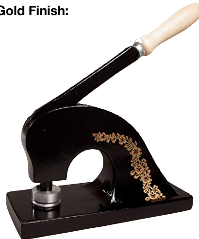
Additional per unit cost: £50+VAT.